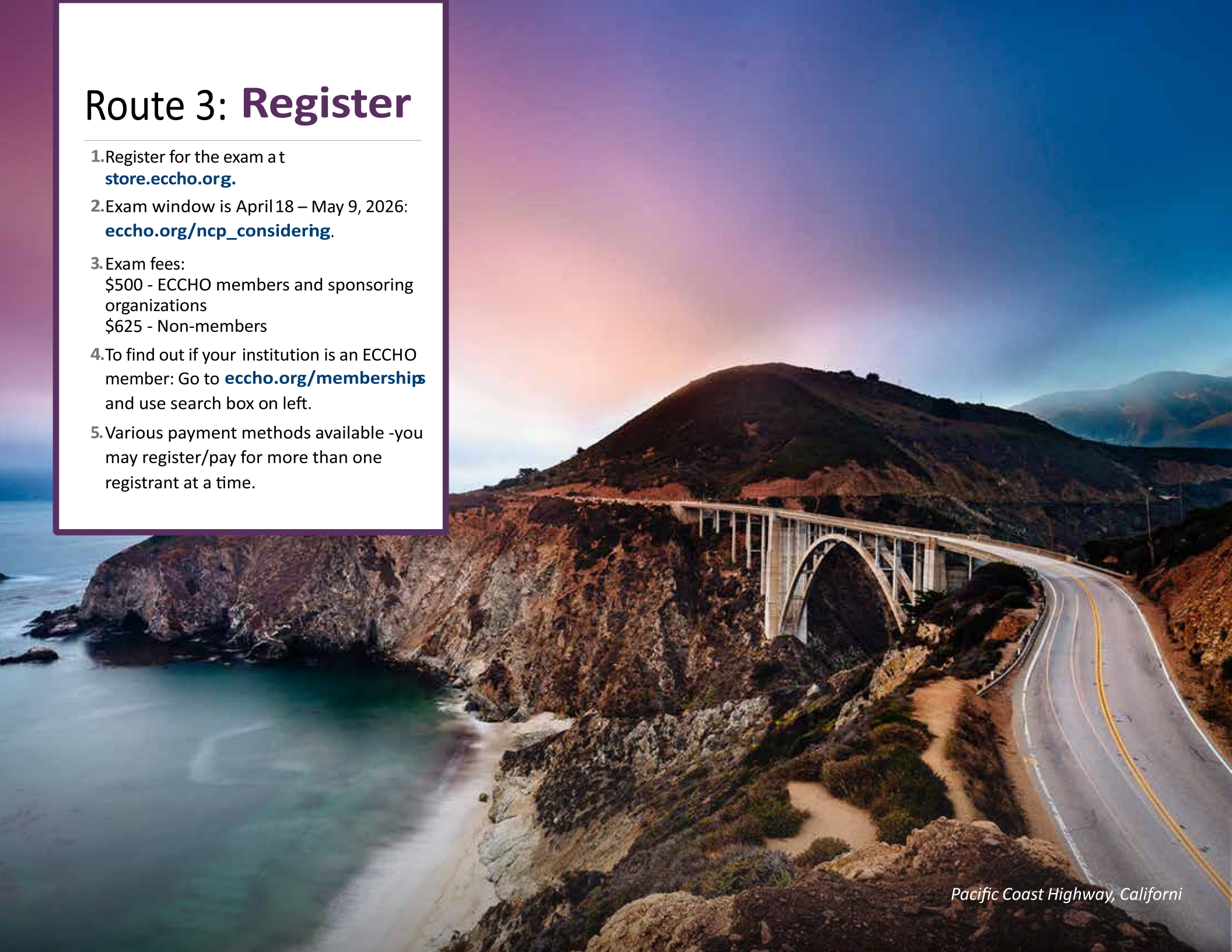
Pacific Coast Highway, California