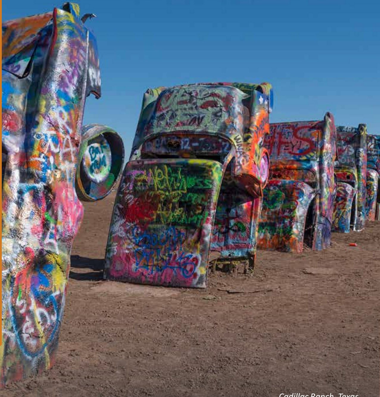
Cadillac Ranch, Texas