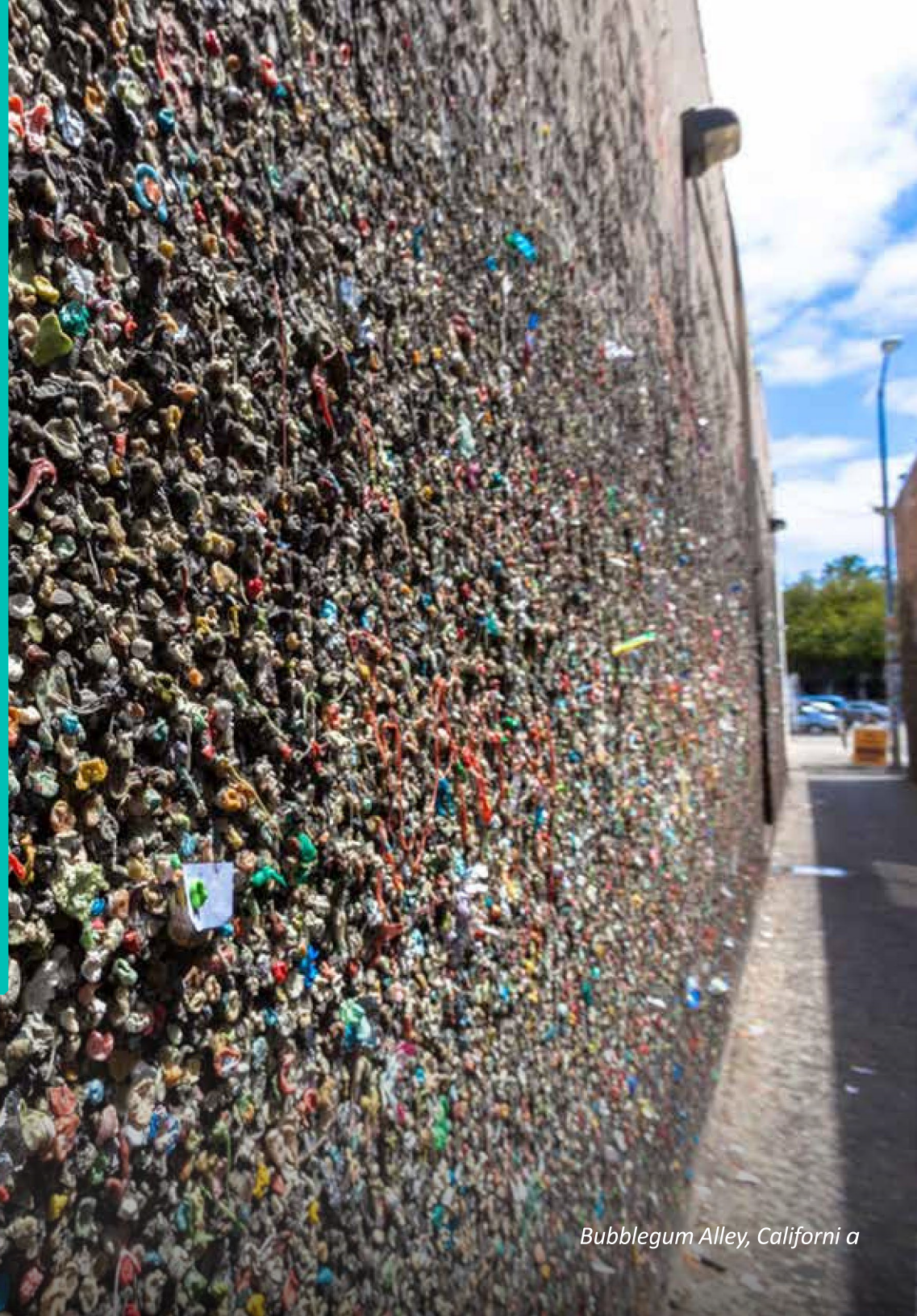
Bubblegum Alley, California