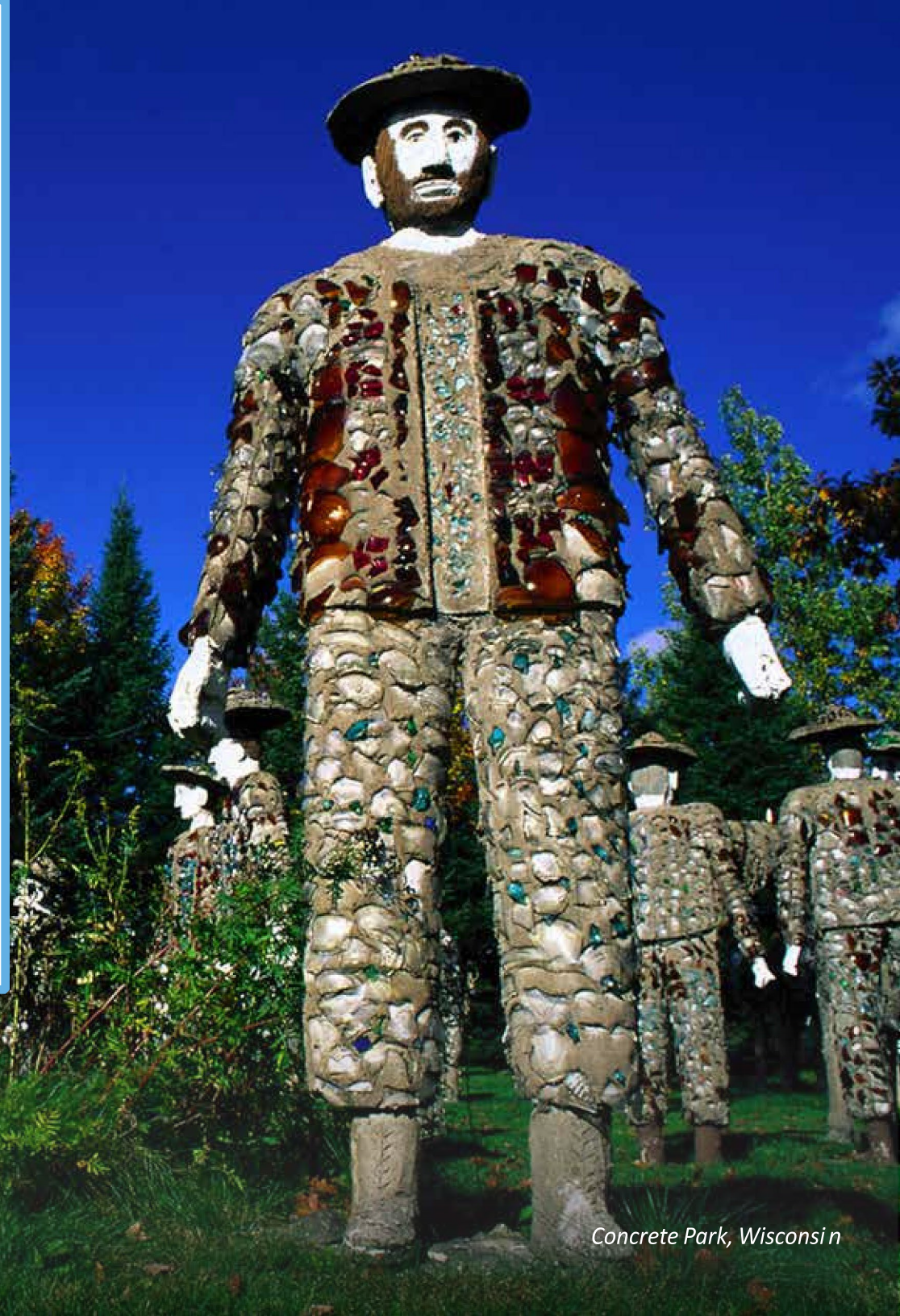
Concrete Park, Wisconsin